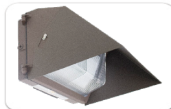
Shown with Optional Shroud See Page A27